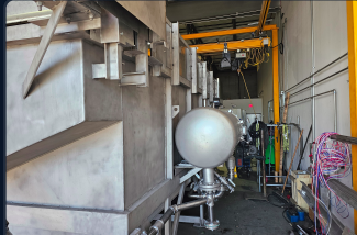
Front side view – pressurization tank