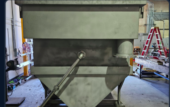
End view – draw off box and effluent outlet