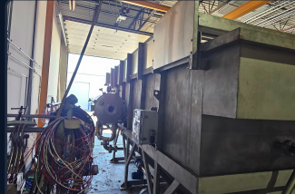
End side view – pressurization tank and air control board