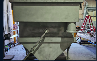
Overhead view — skimmer drive rail & full tank length