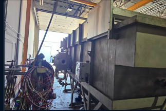
End view — hopper geometry & effluent outlet