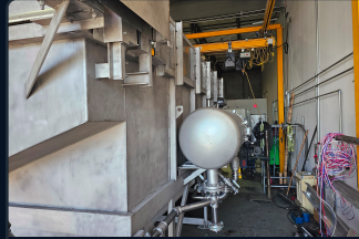
Side view — pressurization system & access platform